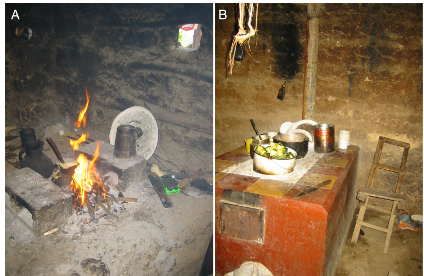
Figure 2 An open fire (A) and a study-provided chimney stove (B) in study participants' homes.

This study presents longitudinal follow-up data from a cohort of children enrolled in the first randomised controlled clinical trial